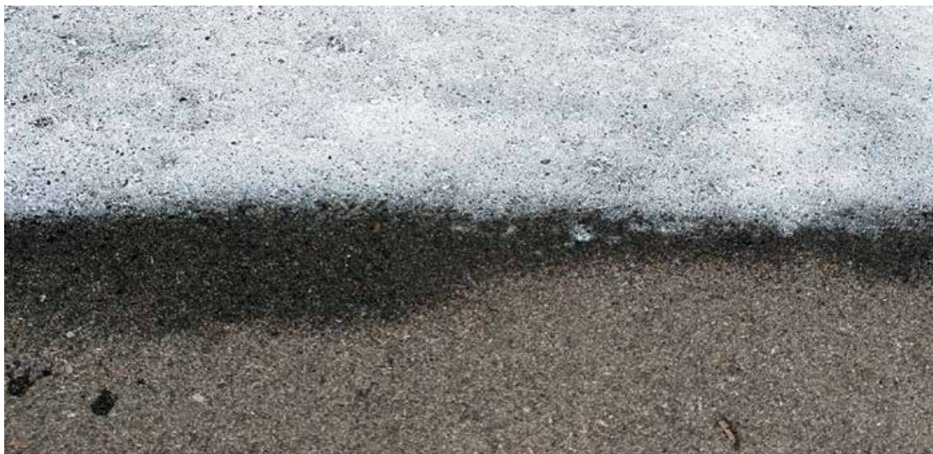
As rejuvenator is absorbed into asphalt surface course, white opaque appearance becomes transparent and takes on color of existing pavement; road can be opened to traffic within an hour or two

This bio-based rejuvenator goes down with a white, opaque color, which makes it easy to see where it's been placed. “It coats the pavement and looks like snow on the road to begin,” PRI's West said. “Within the first 10 minutes of spraying it, you can just see the oil sinking down into the asphalt, and in a half-hour the white is gone, and the asphalt surface gets a darker color. At that point it gets tacky