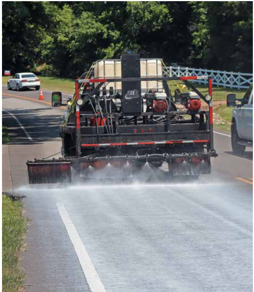
In middle Tennessee, PRI places bio-based rejuvenator on municipal pavement

“Above all I tell them, I’m not going to be tied to one product because there are